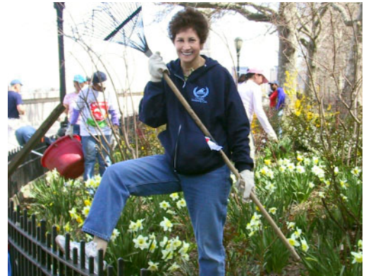
NY Cares Day volunteers