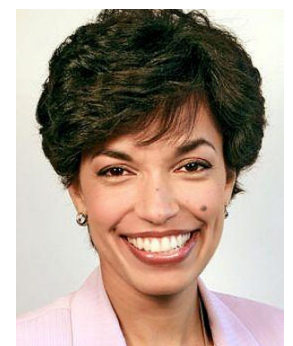
Bonnie St. John