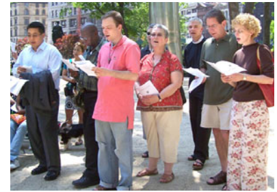
Ecclesia volunteers in Madison Sq. Park