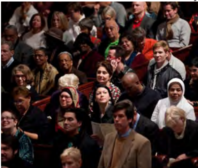
Annual Interfaith Dialogue Service