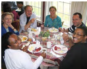
Committed Couples Retreat

$495 includes double occupancy, four meals and materials. Payment plans and childcare are available. A deposit of $75 is due by September 4 . Please register online at www.marblechurch.org or contact Siobhan Tull for further information. (ext 412 or STull@marblechurch.org ).