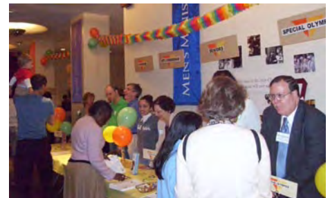
Mission and Outreach Fair